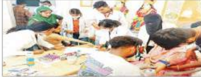
चैकअप कैंप के दौरान मरीजों की जांच करते चिकित्सक।

इस जांच युनिवर्सिटी स्कूलों और पंचायत सेल्फ सहायिता द्वारा प्रयोग प्रदान। मुख्यालय प्रबंधन कमिटी पर एक स्वास्थ्य जांच भी आयोजित किया गया, जिसमें बरिष्ठ चिकित्सक डॉक्टरों और लैबोरेटरी