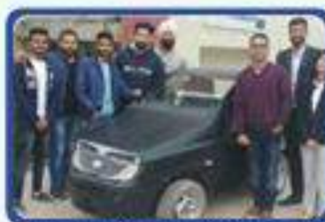
The cost of making this Go-Kart was kept under 25K which was a big achievement .

USET, RBU, has made a four-wheel electric car assembling from the scrap shops. From old tires to batteries, every component is a reused one, making it very economic. This two-seater car is driven by 1000 watt brushless D.C motor powered by four 12 volts lead acid batteries making it fit to drive through a day when fully charged.