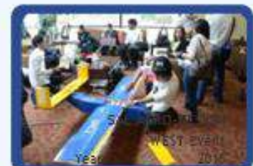
WEST EVENT Year: 2010

Venue: California, USA Position: 1st in Asia, 20th in the World