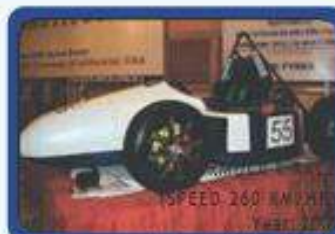
SPEED 260 KM/H Year: 2007

Venue: Michigan, USA Position: 1st in Asia, 13th in the World