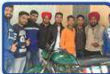
Project . The common objective of the project is to reduce the overall impact of the built environment on human health and the natural environment by reducing waste, efficiently using energy and other resources like converting Wind energy into Electric energy and Kinetic energy into Electric energy.

USET, RBU, has made single cylinder motorbike on dual-fuel operation. This is to run on CNG gas in spite of Petrol.