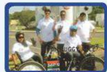
Position: 1st Position in Asia, 12th in the World