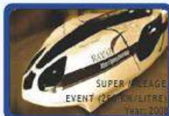
SUPER MILEAGE EVENT (250 KM/LITRE) Year: 2008

Venue: Michigan, USA Position: 1st in Asia, 13th in the World