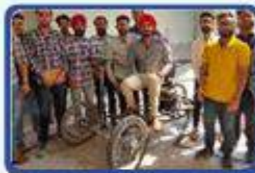
fabrication of a Drift Trike. The fact that each component used in fabrication is collected from the scrap shops. From old tires to batteries, every component is reused, making it very economic.

USET, RBU, has made concept vehicle and a rotating seat. Powered by Solar, this an environmental friendly option. The Easy Parking Car can be drive in both the directions forward and reverse. This model can be pollution free as well as economical as well as needs less maintenance.