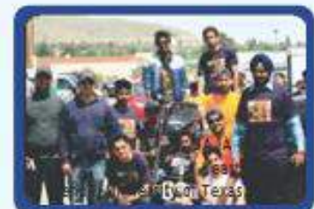
Position: 1st Position in Asia